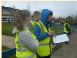
Traffic survey results – before and after campaign

We think so!! We have increased active travel and park and stride, reduced congestion whilst having lots of fun!!!