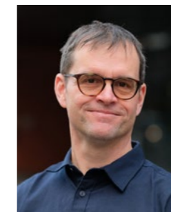
James Hardie Head of IT & Systems