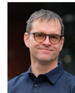
James Hardie Head of IT & Systems